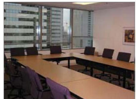
Hearing Room 1

Should you need additional services, you may obtain a list of local vendors from our staff.