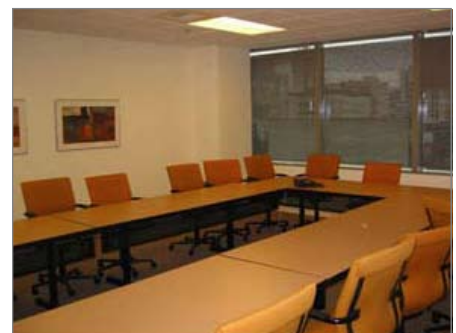
Hearing Room 2